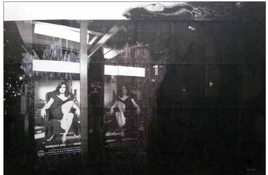
SIREN # B, ALUMINUM LEAF, ACRYLIC, PLASTIC FILM ON CANVAS, 40 x 60 INCHES