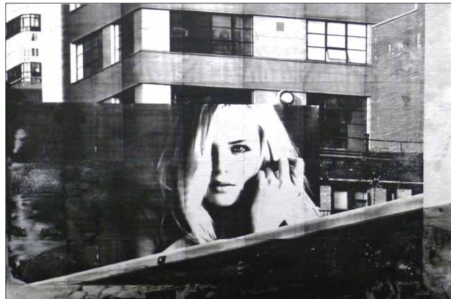
SIREN # N, ALUMINUM LEAF, ACRYLIC, PLASTIC FILM ON CANVAS, 40 x 60 INCHES