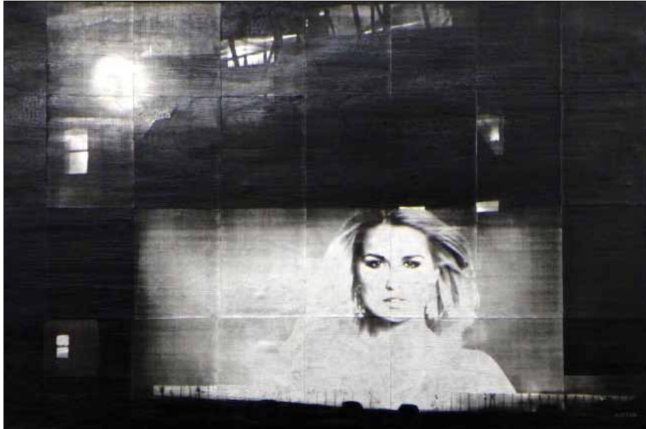
SIREN # Q, ALUMINUM LEAF, ACRYLIC, PLASTIC FILM ON CANVAS, 40 x 60 INCHES