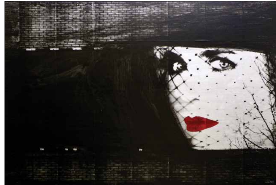
SIREN # T, ALUMINUM LEAF, ACRYLIC, PLASTIC FILM ON CANVAS, 40 x 60 INCHES