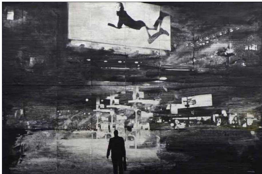
SIREN # R, ALUMINUM LEAF, ACRYLIC, PLASTIC FILM ON CANVAS, 40 x 60 INCHES