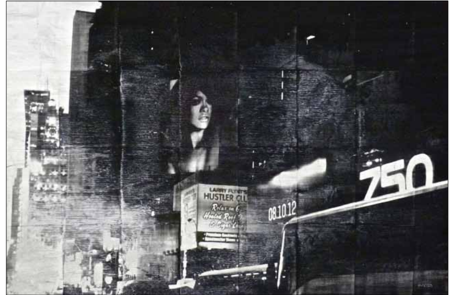
SIREN # M, ALUMINUM LEAF, ACRYLIC, PLASTIC FILM ON CANVAS, 40 x 60 INCHES