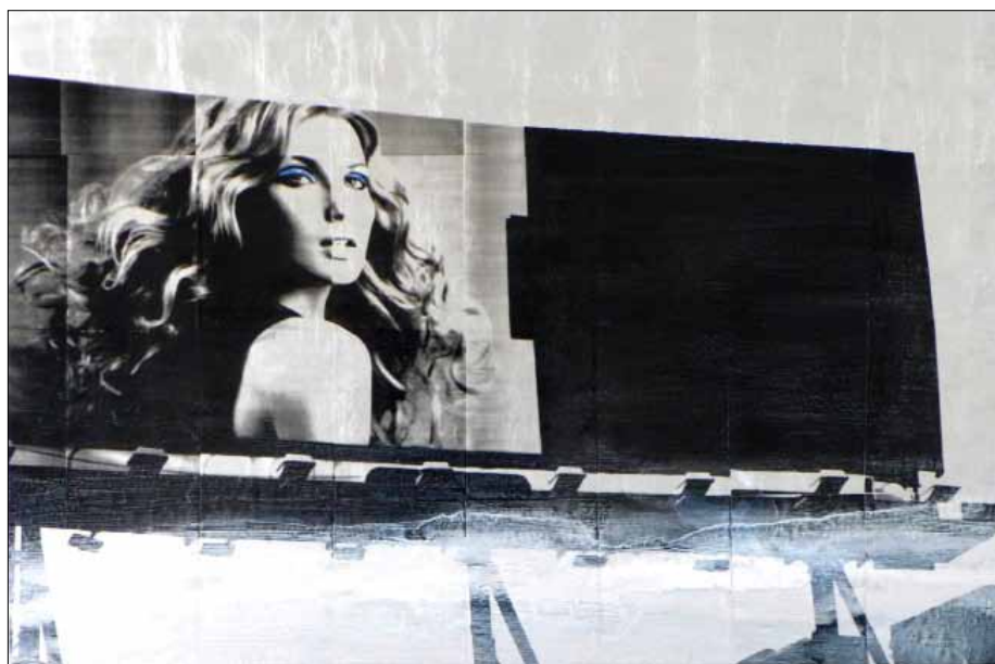
SIREN # U, ALUMINUM LEAF, ACRYLIC, PLASTIC FILM ON CANVAS, 40 x 60 INCHES